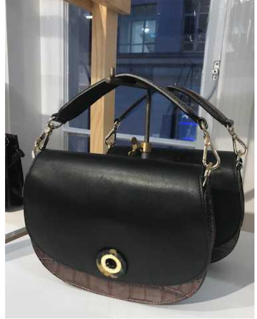
& OTHER STORIES