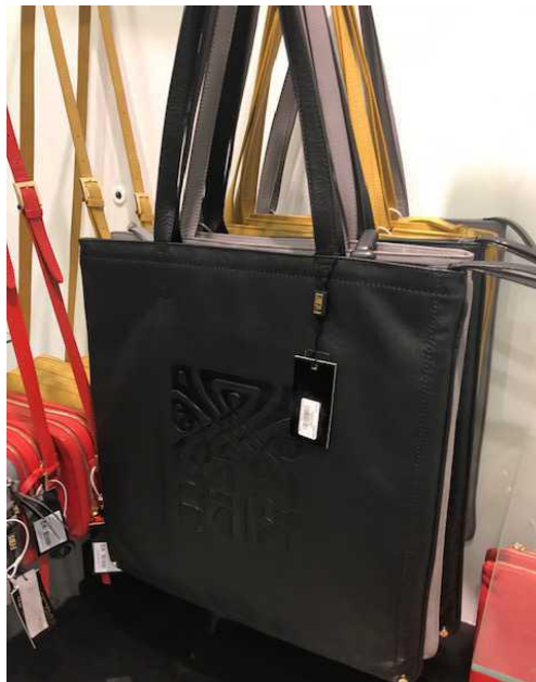
HOUSE OF FRASER