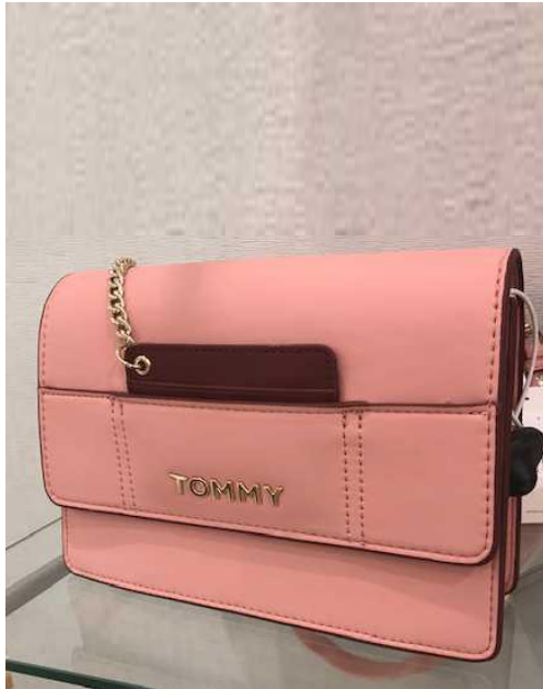
HOUSE OF FRASER