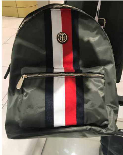
HOUSE OF FRASER