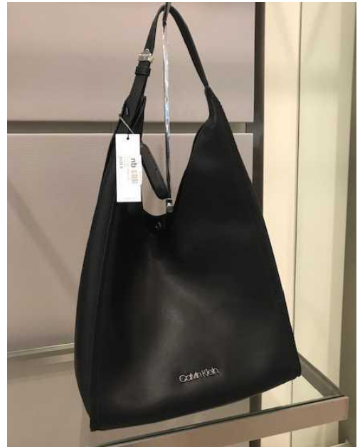
HOUSE OF FRASER