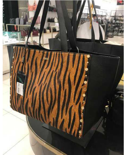
HOUSE OF FRASER