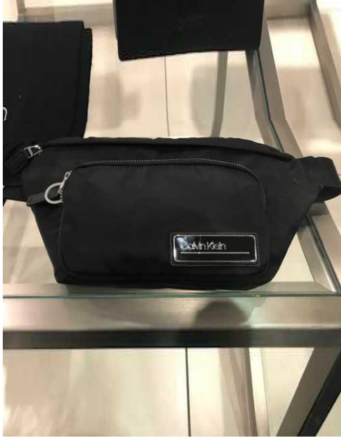
HOUSE OF FRASER

SPORTIVE OR SMART BELT BAG- Casual shapes made of pu, animal pattern pu or nylon. Elements on body like metal logo, puffy effect, beads or decorative strap.