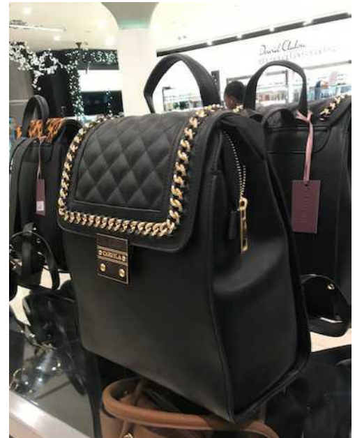
HOUSE OF FRASER