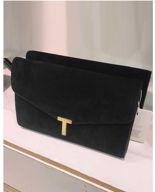
HOUSE OF FRASER