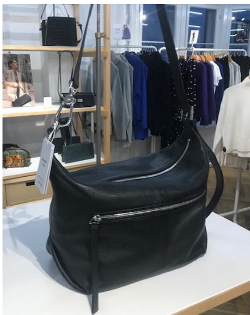
& OTHER STORIES