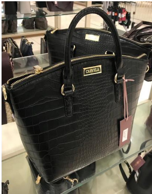
HOUSE OF FRASER