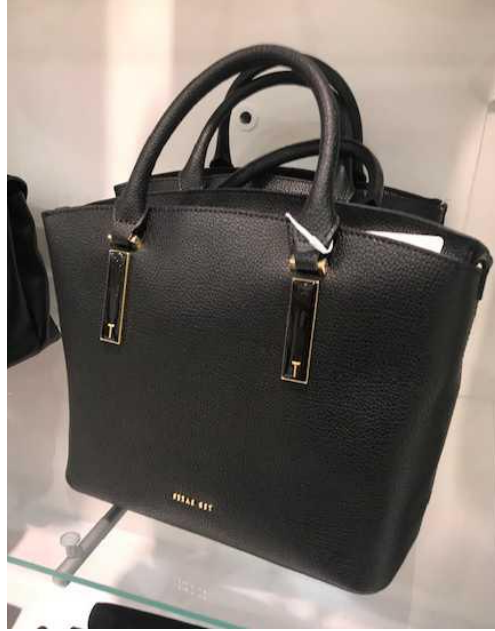
HOUSE OF FRASER