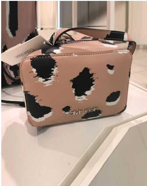
HOUSE OF FRASER

ZIPPER CROSSBODY- Different shapes and size. Simple decorations like stitching, print, emboss logo and metal element.