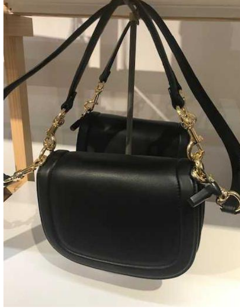
& OTHER STORIES