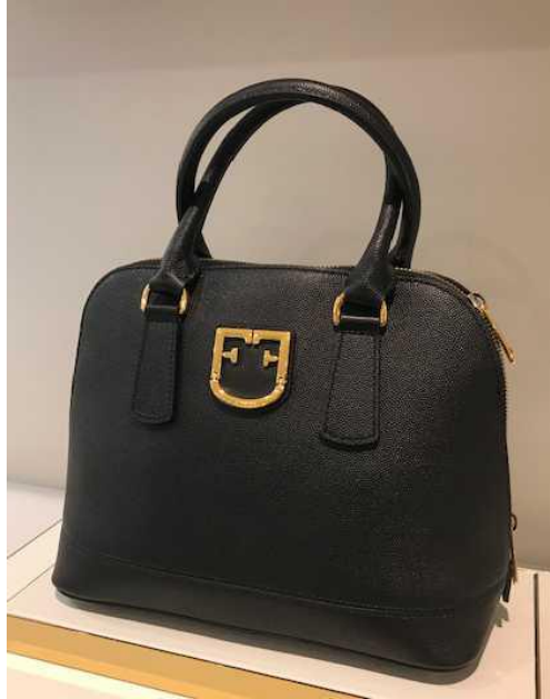
HOUSE OF FRASER