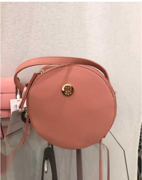
HOUSE OF FRASER