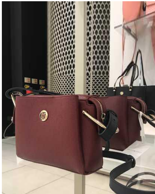
HOUSE OF FRASER